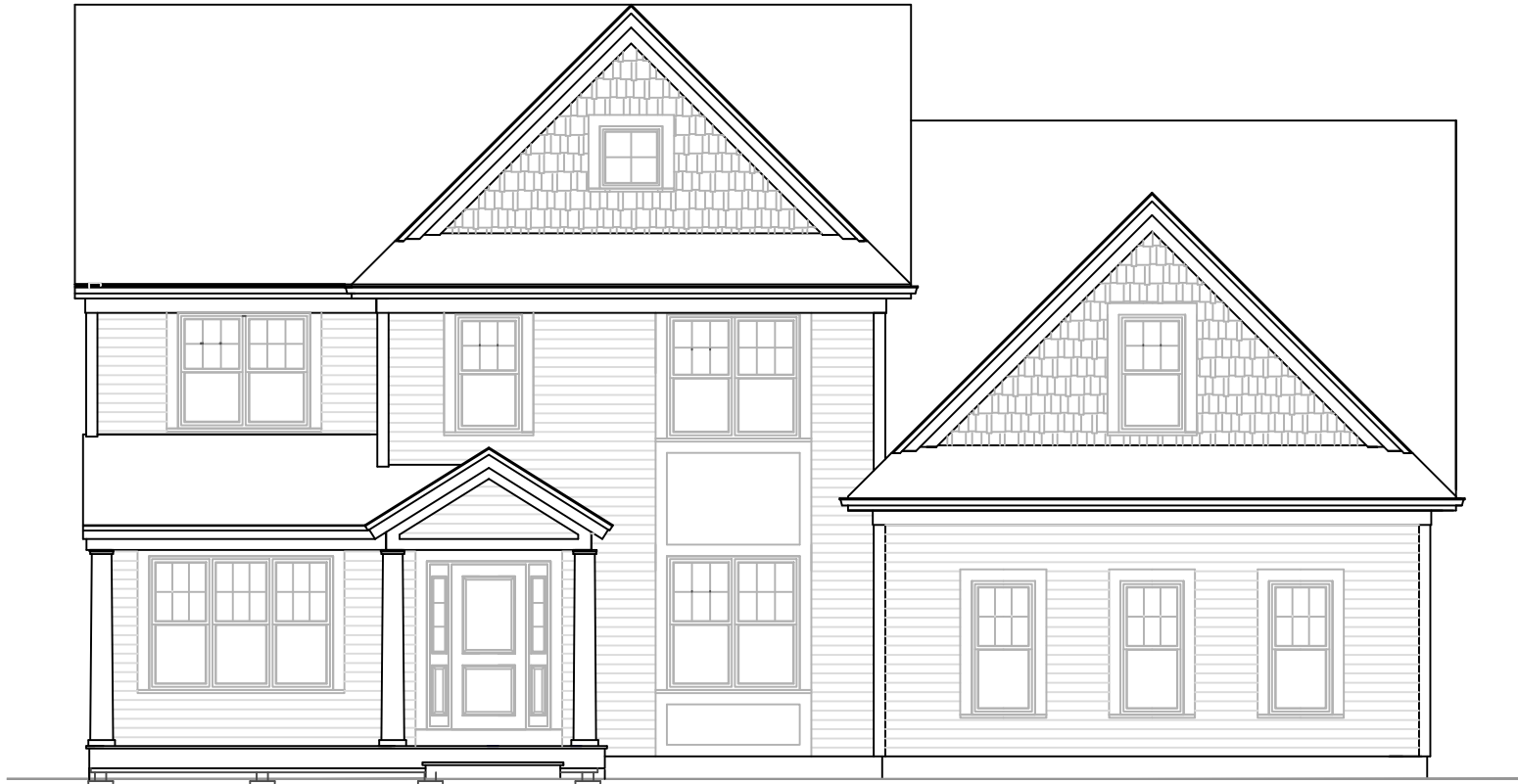
FRONT ELEVATION TOTAL LIVING AREA: 3,036 S.F.