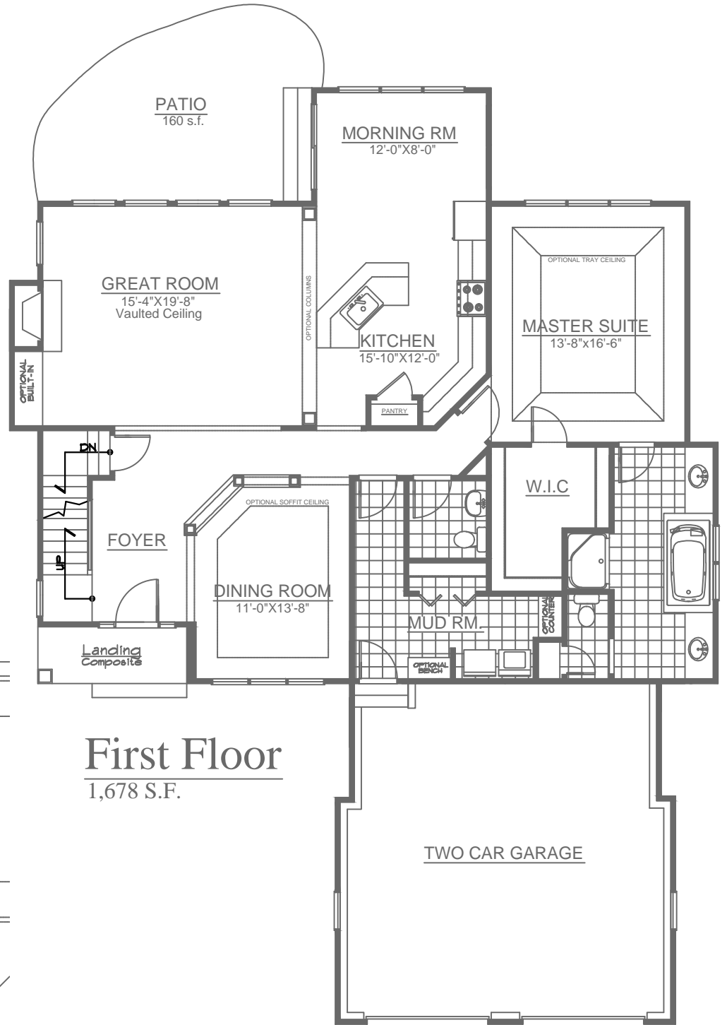
First Floor 1,678 S.F.