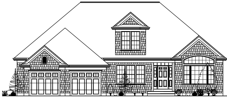
Front View Shown with Optional Second Floor